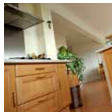
KITCHEN AND BATHROOM